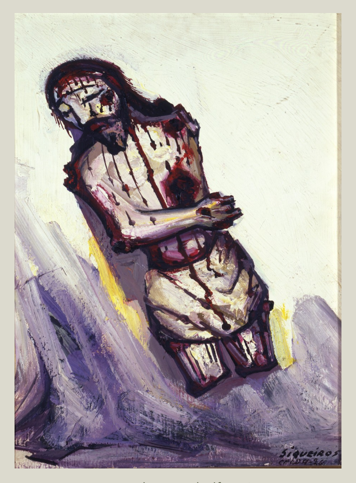
Cristo Mutilado by David Alfaro Siguieros