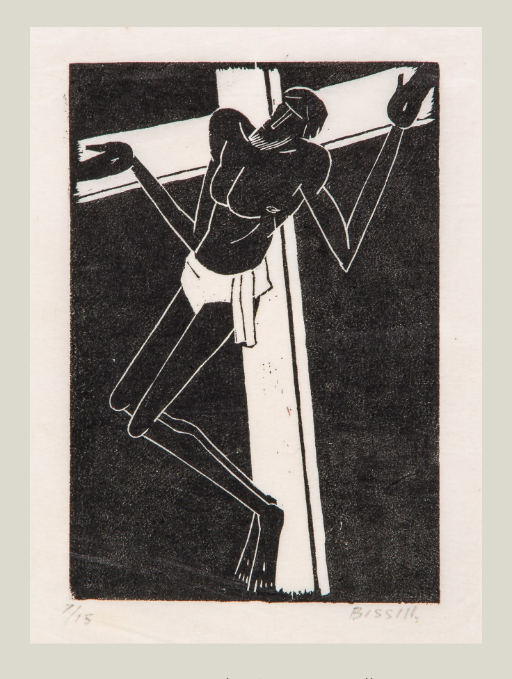
Crucifixion by George Bissill