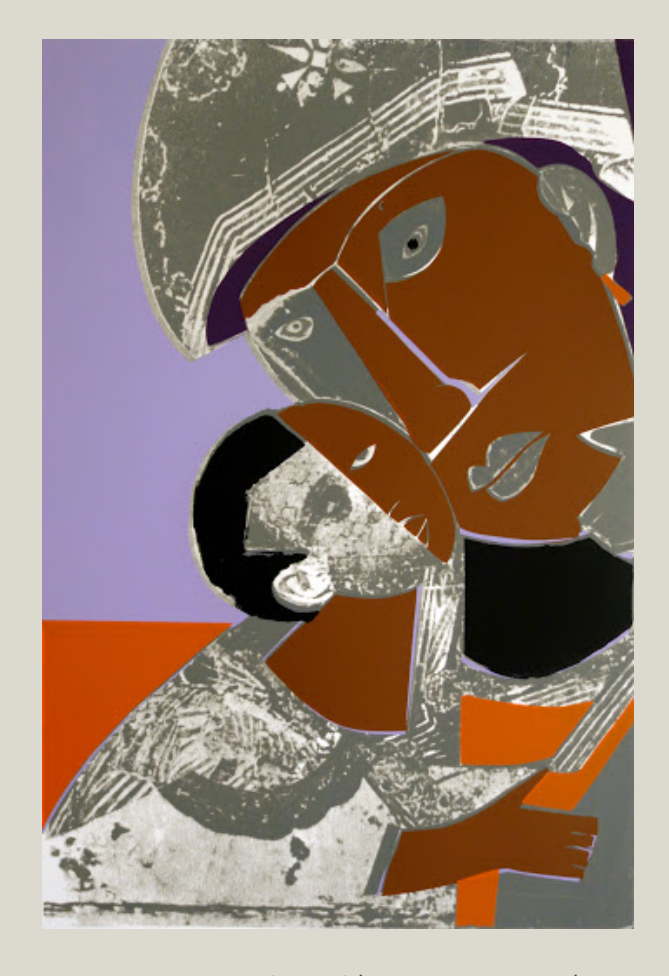
Mother and Child (1972) by Romare Bearden